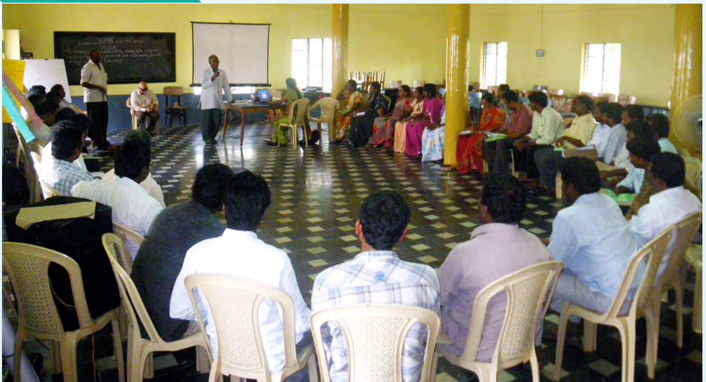
Core Functionaries at “Re-visioning the vision of VRO” workshop at Ananda Jyothi