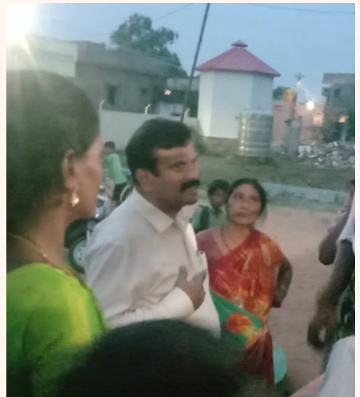
Parents of ESSC in Chandrarajunagar, Nellore interact with PM