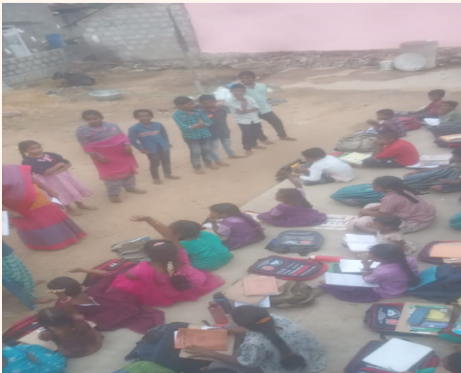
Empower children get involved and speak out their rights - Survival, Development, Protection, Participation in Children mock Parliament. Train on ethical practices and give every child a fair chance to succeed.