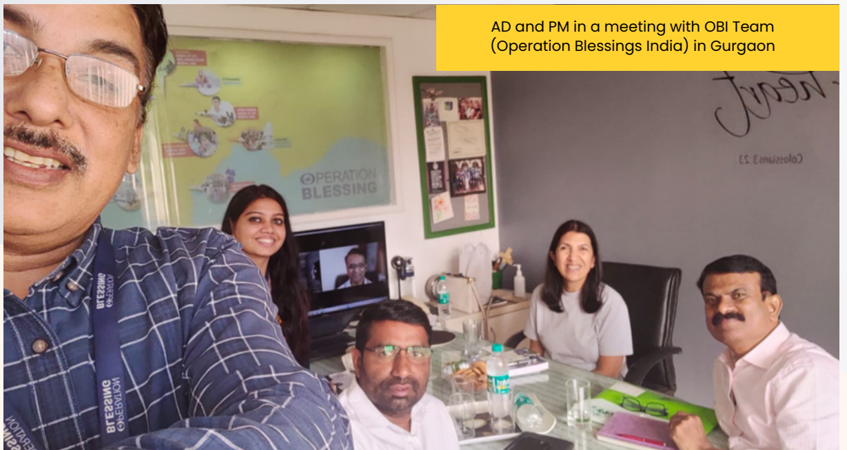
AD and PM in a meeting with OBI Team (Operation Blessings India) in Gurgaon