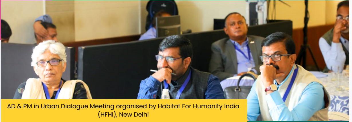
AD & PM in Urban Dialogue Meeting organised by Habitat For Humanity India (HFHI), New Delhi