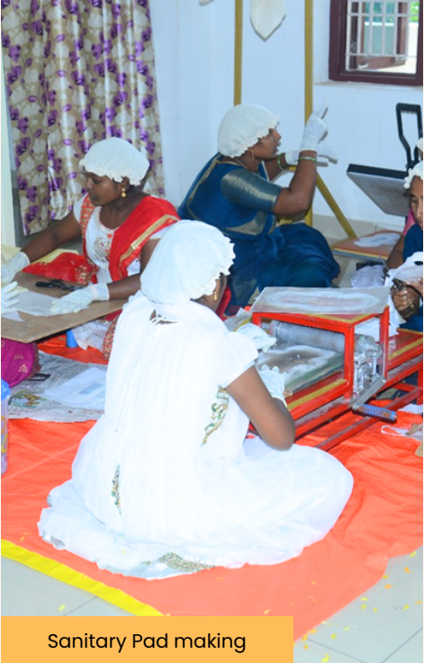
Sanitary Pad making