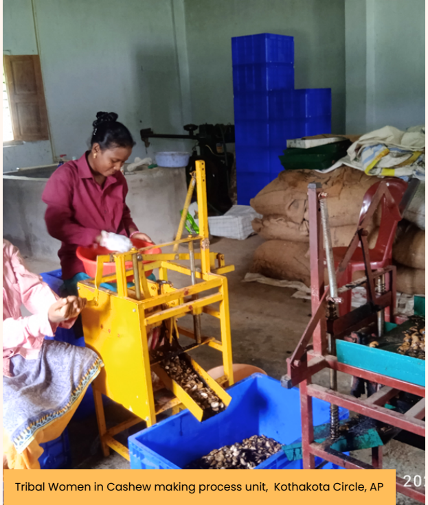
Tribal Women in Cashew making process unit, Kothakota Circle, AP