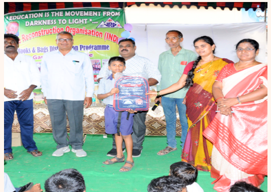
Supportive Academic Assistance -ESSC Children with their school bags and note books

“If the Society is not able to devote attention and track the growth and development of children very rigorously and in a high quality manner, then we are dealing with a civilizational problem”. Provide every child with better education to excel in studies. Childhood is precious and VRO cares. Children say ‘ESSC, We are ready’ and Community workers are champions for children. 5601 children are enrolled in ESSCs from 136 villages across 4 states.