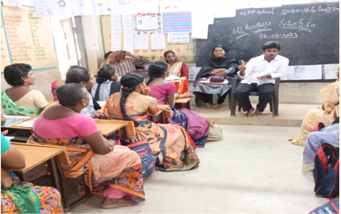
Parents committee meetings brings together the stakeholders to discuss the challenges. It gives hope and renewed sense of purpose to parents of children with average performance. ESSC Children engaged in Premises cleaning as part of Sevice