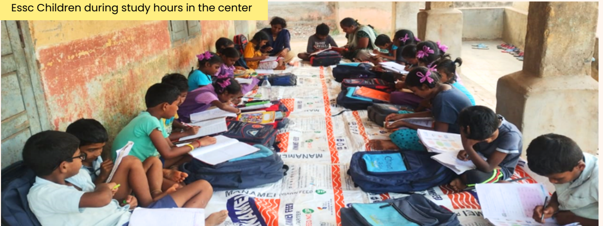
Essc Children during study hours in the center